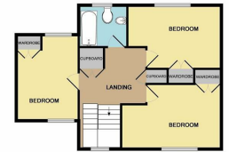
FIRST FLOOR APPROX FLOOR AREA 50.8 SQ.M. (545 SQ.FT.)