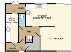
GROUND FLOOR APPROX FLOOR AREA 102.2 SQ.M. (1076 SQ.FT.)